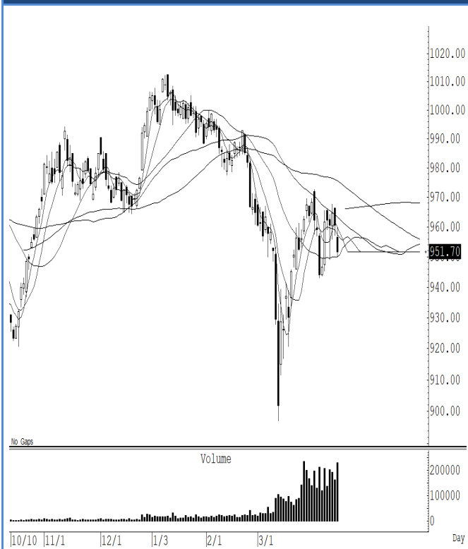
S50M23 (Close 951.70 Chg -8.90)

ปรับตัวลงมากกว่าคาดเล็กน้อย ปิดใกล้จุดต่ำสุดของวัน สะท้อน momentum ที่เริ่มอ่อนแรง สั้น ๆ ตีกลับไม่ข้ามแถว ๆ 956 จุด แนะนำ trading ในกรอบระหว่าง 956-943 จุด ระวังกำไร